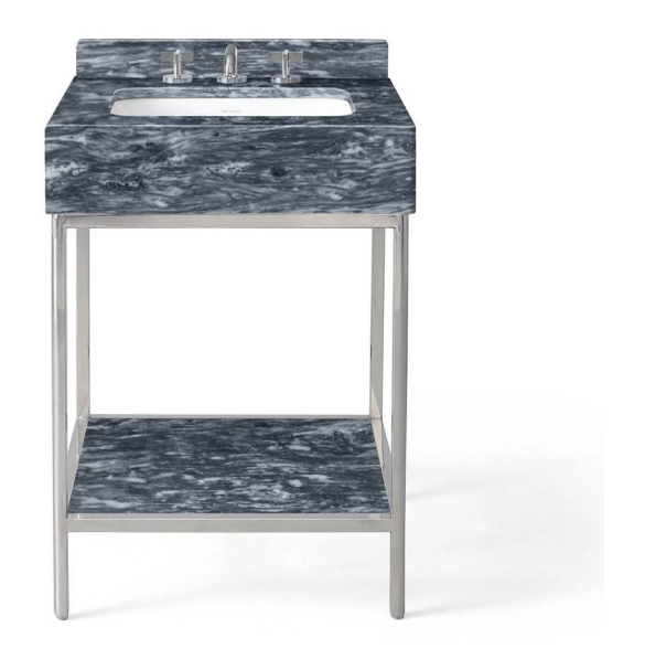
24" W single vanity in polished stainless steel in Catia Black