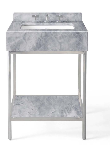
24" W single vanity in polished stainless steel in Catia Grey