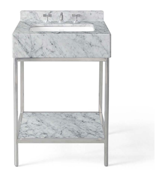
24" W single vanity in polished stainless steel in Carrara