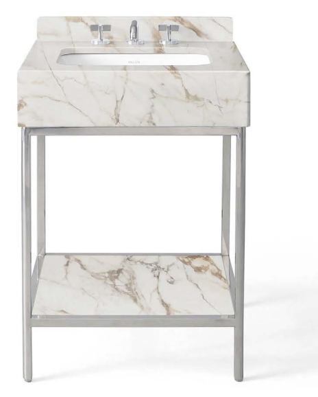
24" W single vanity in polished stainless steel in Calacatta